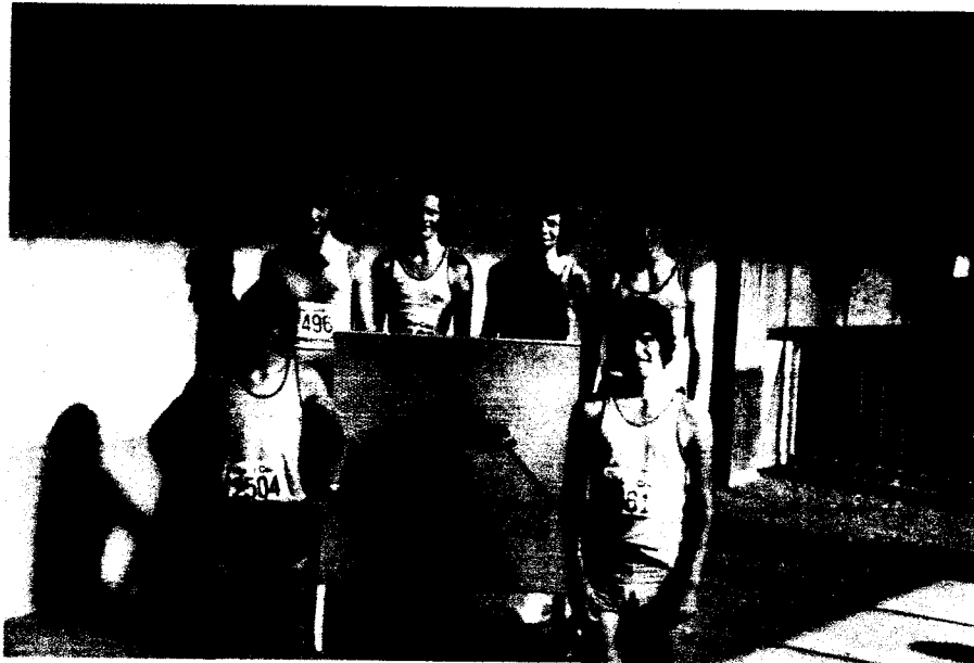
Members of the Association premiership team - U14, 1979.

The wave of success continued into the winter season where the benefits of consistent distance coaching enabled DAC to easily win the 2 E grade premierships.