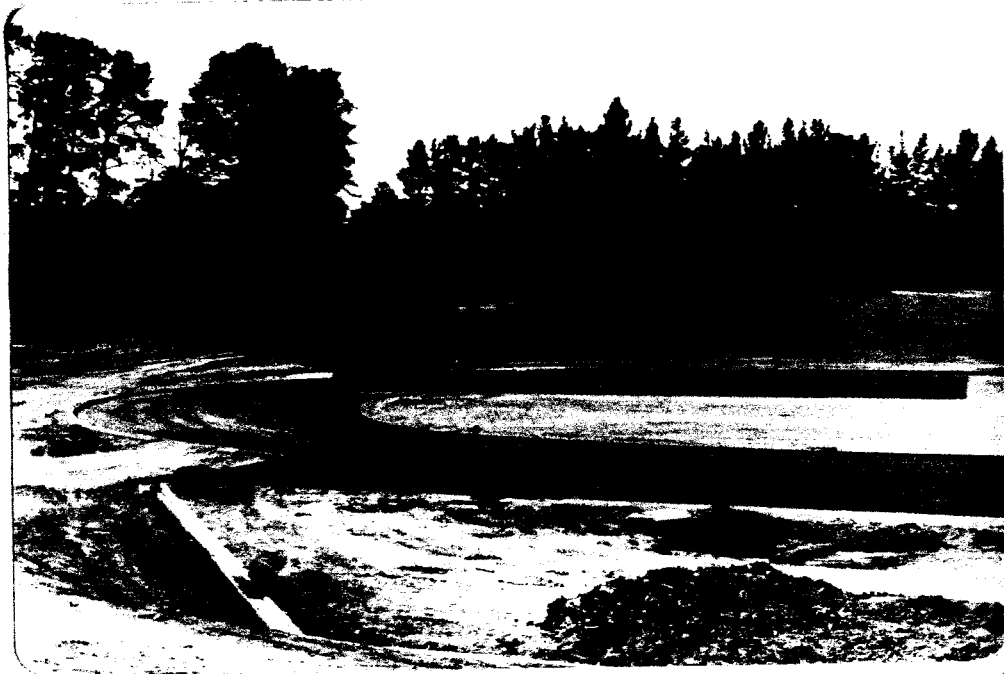
ATHLETIC TRACK UNDER CONSTRUCTION - 1976

The time schedule for the completion of the track was revealed and created an urgent need to improve finances in order to contribute to the equipping of the ground. The fund-raising sub-committee formed in 1974 worked ahead of budget to enable a successful move to George st. The track was officially opened during August 1976.